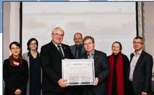
26/10/17: University of Cologne, new CG member